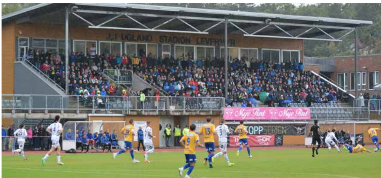
Jerv playing home match in local derby against Arendal. The new main stand in the background.

They get a simple and healthy meal and then it's time for homework, with helpers on hand to provide assistance. They finish up with around 75 minutes of football training with players from Jerv's A-team and junior teams. FFO has become very popular, with over 20 children participating several days a week.