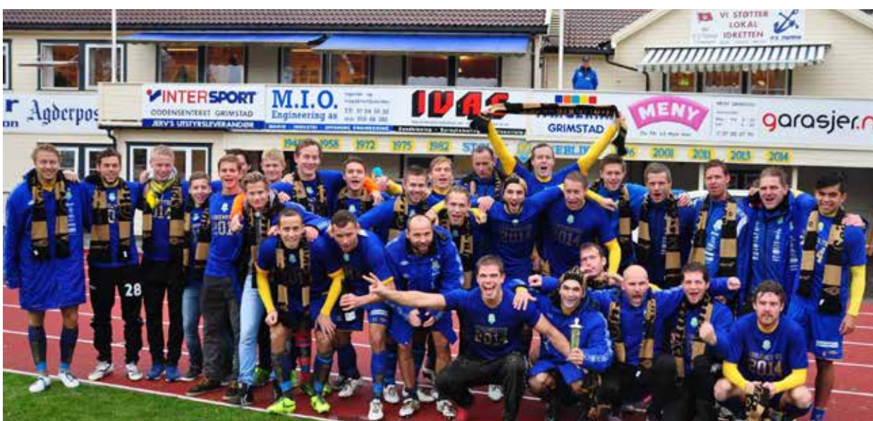
The Jerv team celebrating promotion to Division 1