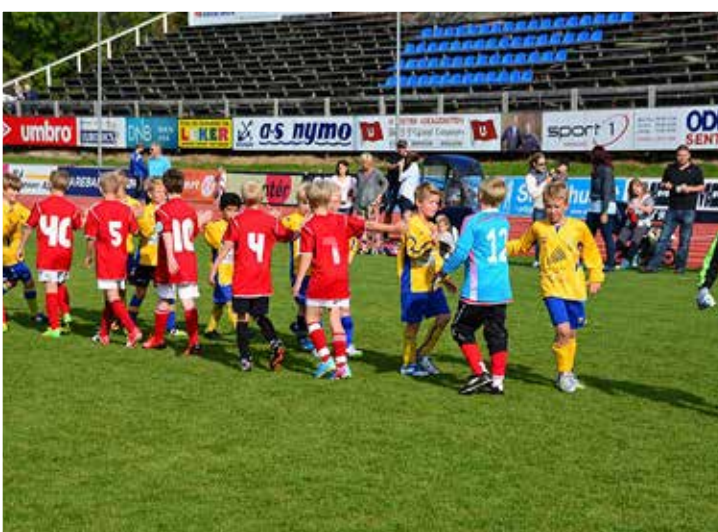
Establishing good values is just as important as developing football skills