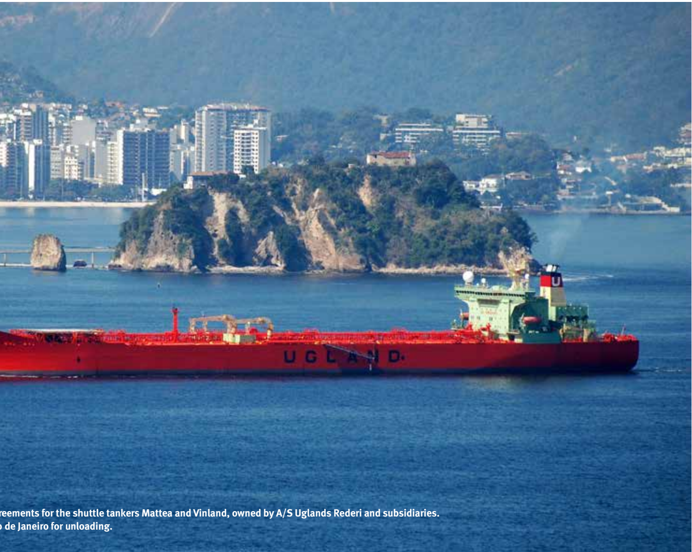
Agreements for the shuttle tankers Mattea and Vinland, owned by A/S Uglands Rederi and subsidiaries. Rio de Janeiro for unloading.