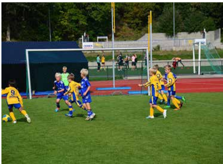
Above and below: All local children are invited to join Jerv

The team expects to see many spectators and strong local involvement – with Bergen's football pride Brann as the most famous visiting team this season.