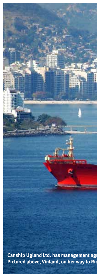
Canship Ugland Ltd. has management agreement with Statoil Petroleum AS. Pictured above, Vinland, on her way to Rio de Janeiro.

The office staff included 60 people employed by Ugland Marine Services AS in Grimstad, 7 people employed by Ugland Construction AS in Stavanger and 27 people employed by Canship Ugland Ltd. in St. John's. Women constituted 31% of the total office staff. Vacancies are filled with the best qualified person, and the same practice is also used to avoid discrimination. Seafarers constituted 765 people, with 338 Filipinos, 343 Canadians, 69 Norwegians, 9 Swedes and 6 from other nations. The crew members' nationality reflects the vessels' trading area. For vessels trading in international waters, the company has a long-standing cooperation with a Philippine crewing company. The seafarers are employed on contracts complying with approved employment settlements in their respective countries.